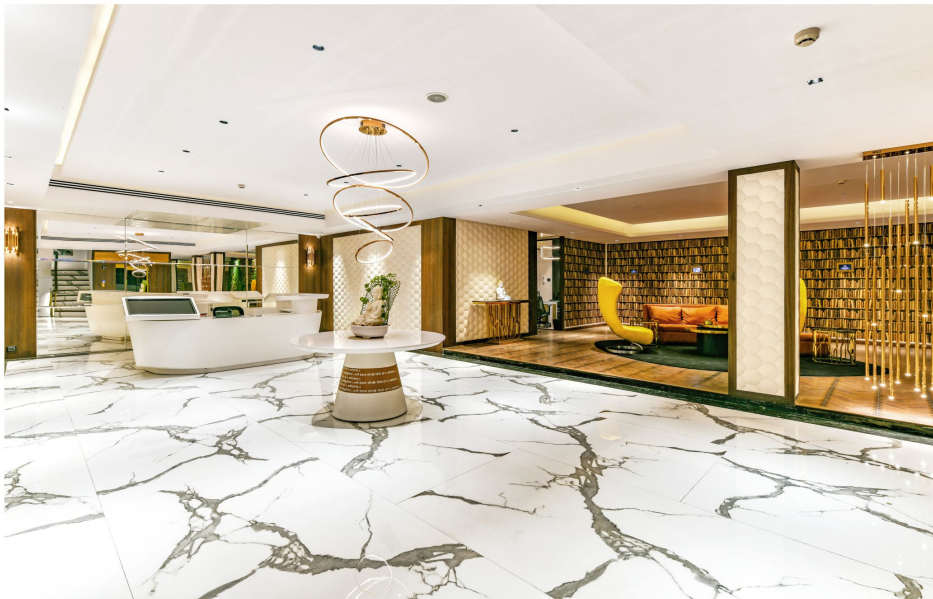
MGS - Modern Green Structures & Architecture September 2019